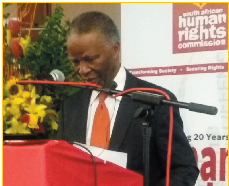
Former President Thabo Mbeki delivering the main address at the 20 years of the SAHRC Conference

In the 20 years of its existence the commission has provided individuals and groups with resolutions of