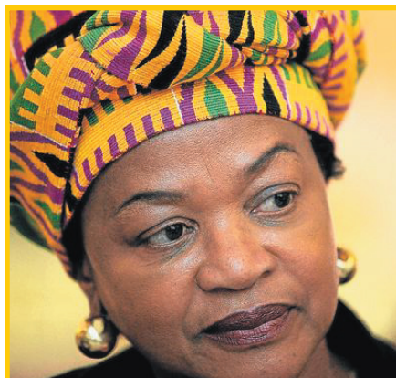
Speaker of the National Assembly, Baleka Mbete raised concern over economic challenges.