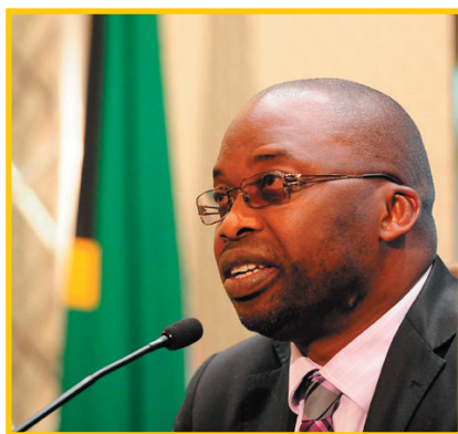
Minister Michael Masutha is concerned about incidences of violence against sexual minorities.

Minister Masutha said Resolution 275 condemns the increasing incidence of violence and other human rights violations, including murder, rape, assault, arbitrary imprisonment and other forms of persecu-